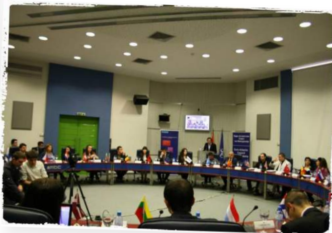
NATO and partner countries - future challenges and what to expect?!