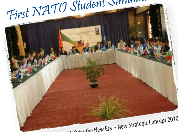
NATO Summit: New NATO for the New Era – New Strategic Concept 2010