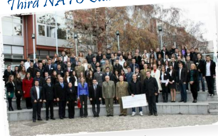
Meeting of NATO ministers of Defence: NATO and Afghanistan - ISAF Mission and beyond