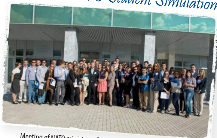
Meeting of NATO ministers of foreign affairs: NATO Enlargement and Western Balkans