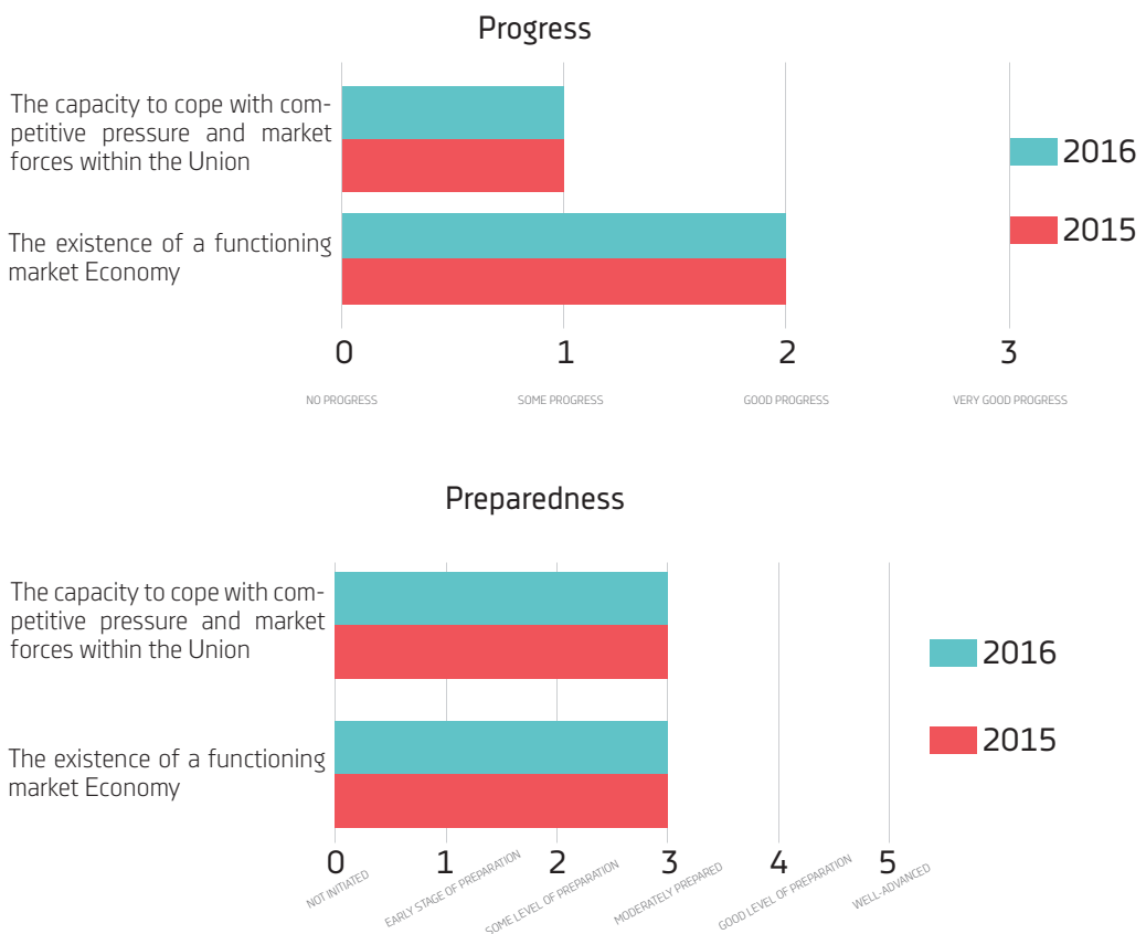
Graph 1. Comparative overviews of the levels of progress and preparedness in 2015 and 2016, for the economic criteria.

In general, it can be noticed that the Commission's tone varies from commending the efforts to highlighting some negative aspects of Serbia's economic performance. While some statements stress the fact that the country "remained committed", "reduced imbalances", "improved", "advanced", etc., a roughly equal number of concerns have been raised, too, focusing, for example, on the high government debt, youth unemployment, underdeveloped private sector, education system that does not match societal needs, and an unfavourable environment for SMEs. Several remarks have been repeated compared to the previous year (e.g. the need to sustain fiscal consolidation or the demand for increased focus on human capital policies). In addition, there is a number of predominantly neutral statements, only expressing the facts or emphasising the country's potential for further advancement. Nevertheless, a general impression is that the Commission continues to be predominantly encouraging, despite the concerns mentioned above and without looking back to the previous years' results.