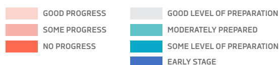
Table 1. Overview of the progress and preparedness levels according to the Commission's 2015 and 2016 reports

Starting from the 2015 assessment, the European Commission uses uniform 5-point scales to assess the level of progress of the enlargement countries towards the EU, as well as their preparedness for taking on the membership obligations, within 33 negotiating chapters. When comparing 2015 and 2016 reports, Serbia records an overall lower score in terms of progress, but is slightly more prepared for membership than in the previous assessment year.